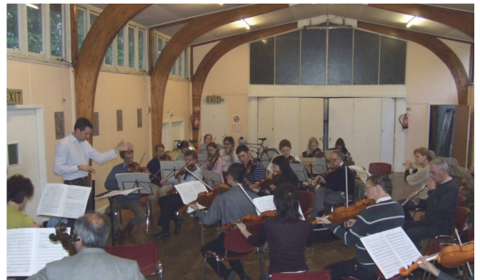
A thriving congregation and community groups use the space today