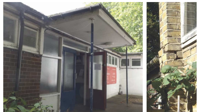
Sixty years on, and the building urgently needs to be replaced